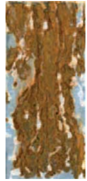
Hot dip galvanised after 6 weeks