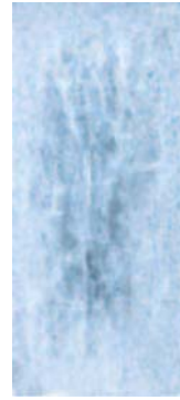
Magnelis® after 34 weeks