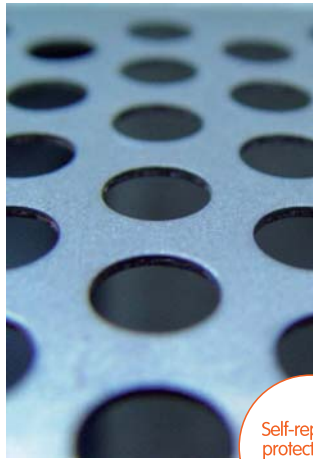
Self-repairing protection for cut edges