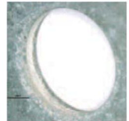
16 months 10% red rust 70% white rust

Outdoor exposure over different time periods of Magnelis® ZM310 with 2 mm thickness in Brest (France) Marine category C5-M (the most severe) Institut Français de la Corrosion