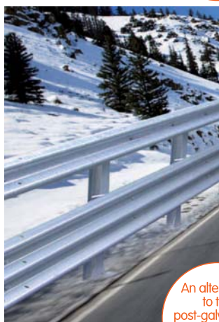
An alternative to the post-galvanising process and to aluminium or stainless

The chemical composition of Magnelis® has been optimised to provide the best corrosion-resistance results.