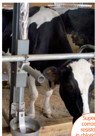
Superior corrosion resistance in chloride and ammonia environments